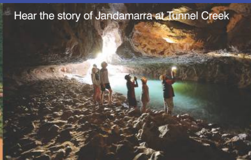
Hear the story of Jandamarra at Tunnel Creek