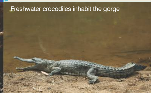
Freshwater crocodiles inhabit the gorge

Napier Range | Windjana Gorge | Lennard River | Historic Ruins at Lillimooloora | Tunnel Creek