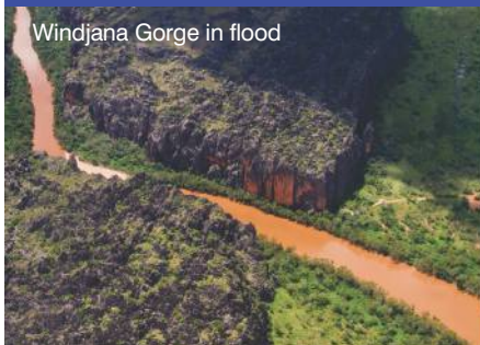
Windjana Gorge in flood