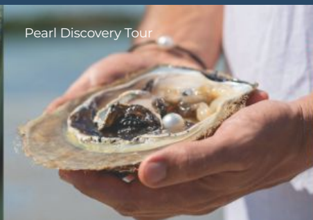
Pearl Discovery Tour