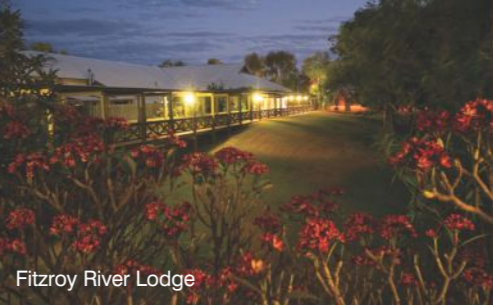
Fitzroy River Lodge