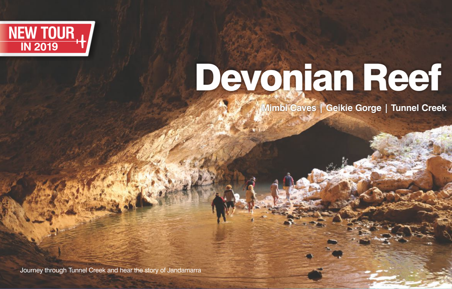
Journey through Tunnel Creek and hear the story of Jandamarra

Mimbi Caves | Geikie Gorge | Tunnel Creek