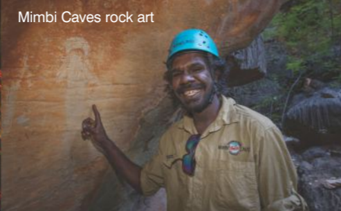
Mimbi Caves rock art