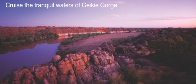
Cruise the tranquil waters of Geikie Gorge