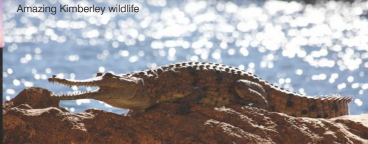
Amazing Kimberley wildlife