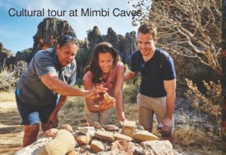
Cultural tour at Mimbi Caves

Roebuck Bay | Roebuck Plains | Fitzroy River | St George Ranges | Mimbi Caves | Geikie Gorge | Fitzroy River Lodge Fitzroy River Town Tour | Windjana Gorge | Tunnel creek | Lennard river | Lillimooloora Ruins