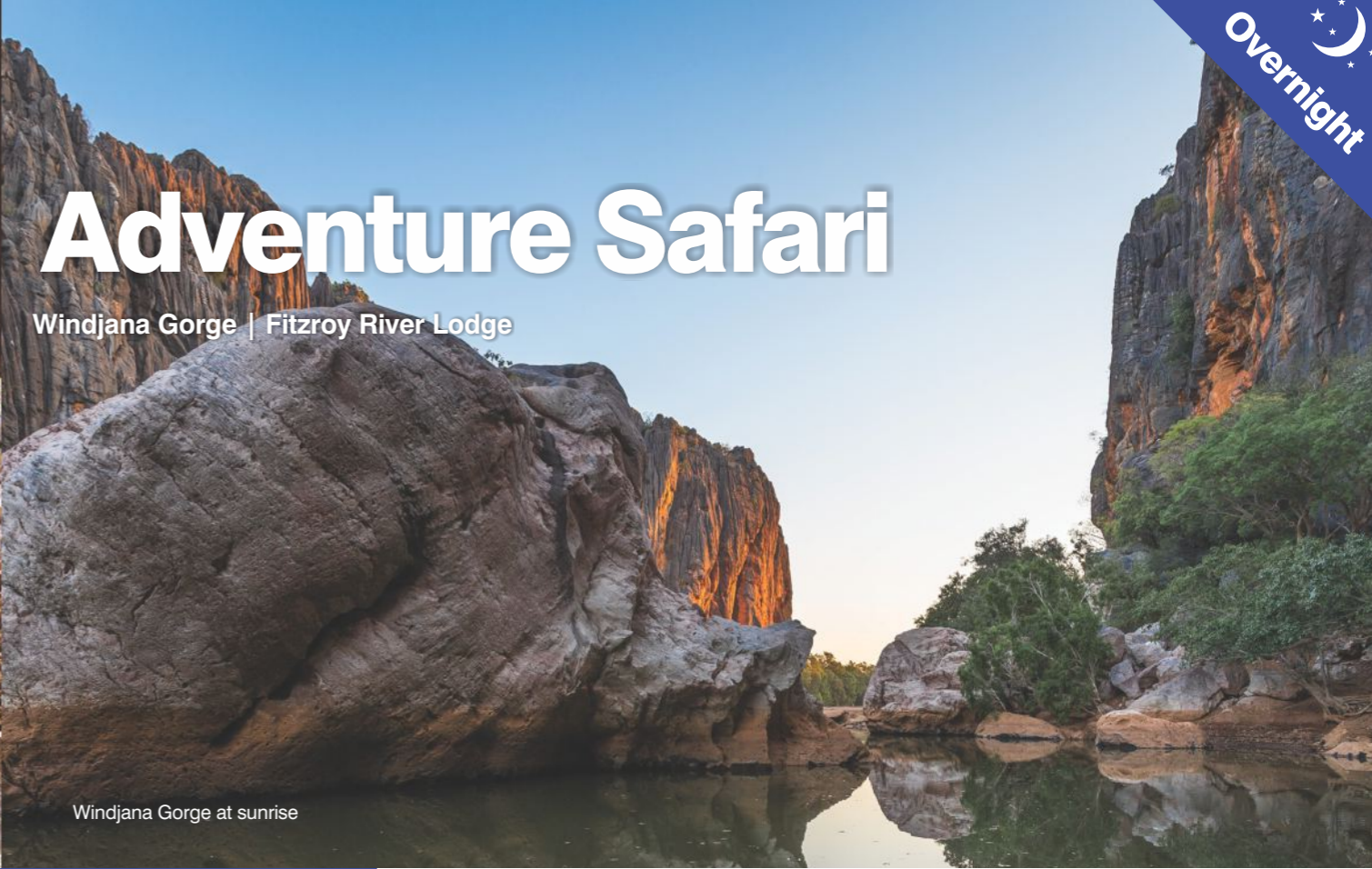
Windjana Gorge at sunrise