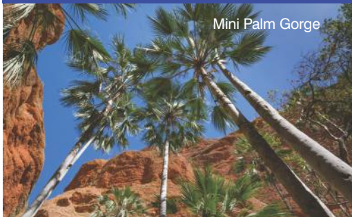
Mini Palm Gorge