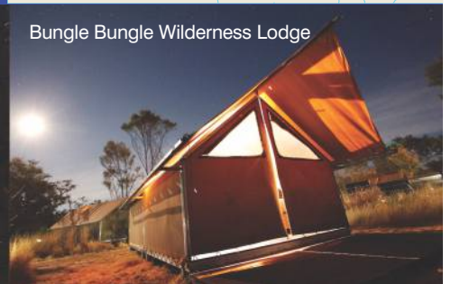
Bungle Bungle Wilderness Lodge

Fitzroy River | King Leopold Ranges | Bungle Bungles | Cathedral Gorge | Echidna Chasm | Halls Creek Mini Palm Gorge | Bungle Bungle Wilderness Lodge | Great Sandy Desert | St Georges Ranges | Roebuck Bay