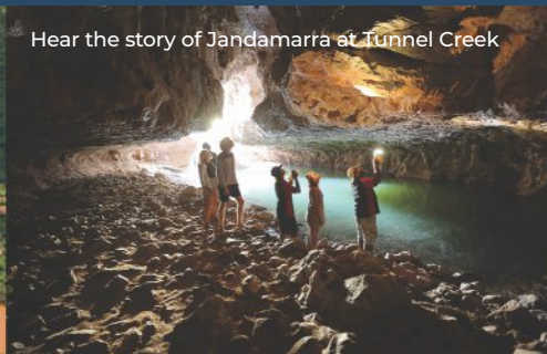
Hear the story of Jandamarra at Tunnel Creek