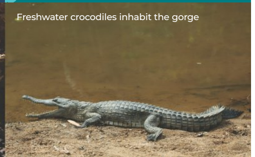
Freshwater crocodiles inhabit the gorge

Napier Range | Windjana Gorge | Lennard River | Historic Ruins at Lillimooloora | Tunnel Creek