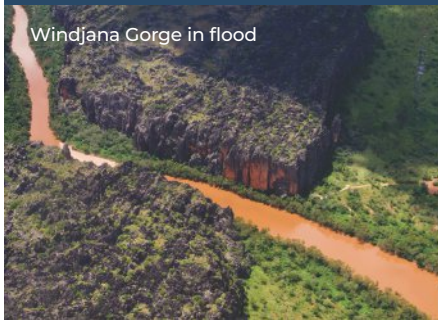
Windjana Gorge in flood