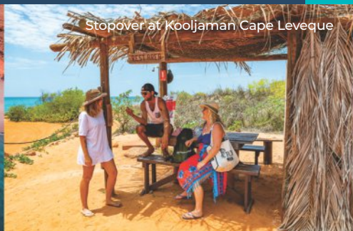
Stopover at Kooljaman Cape Leveque