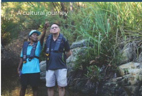
A cultural journey