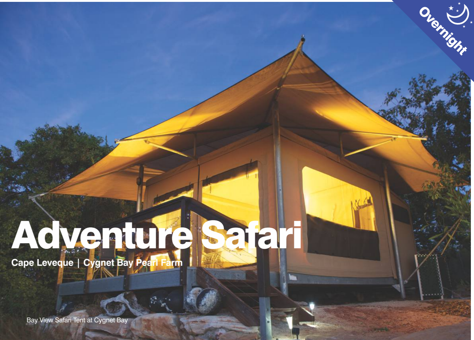
Bay View Safari Tent at Cygnets Bay