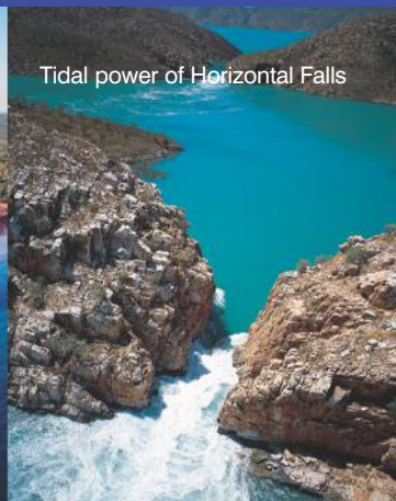
Tidal power of Horizontal Falls