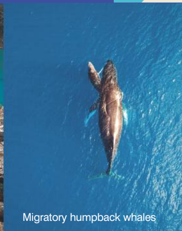
Migratory humpback whales