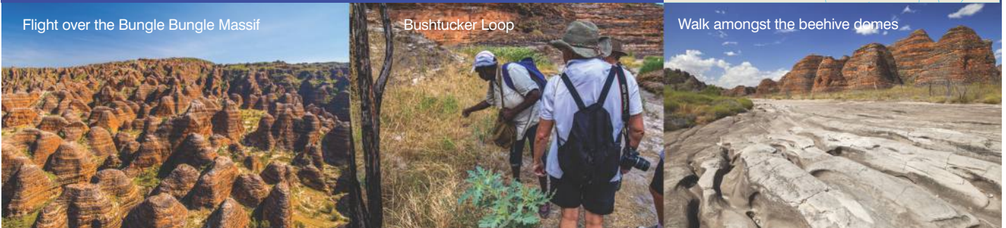
Walk amongst the beehive domes

Fitzroy River | Geikie Gorge | Halls Creek | Bungle Bungles | Cathedral Gorge | Windjana Gorge | Roebuck Bay