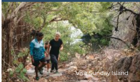
Visit Sunday Island