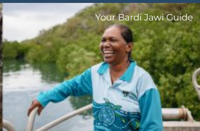
Your Bardi Jawi Guide